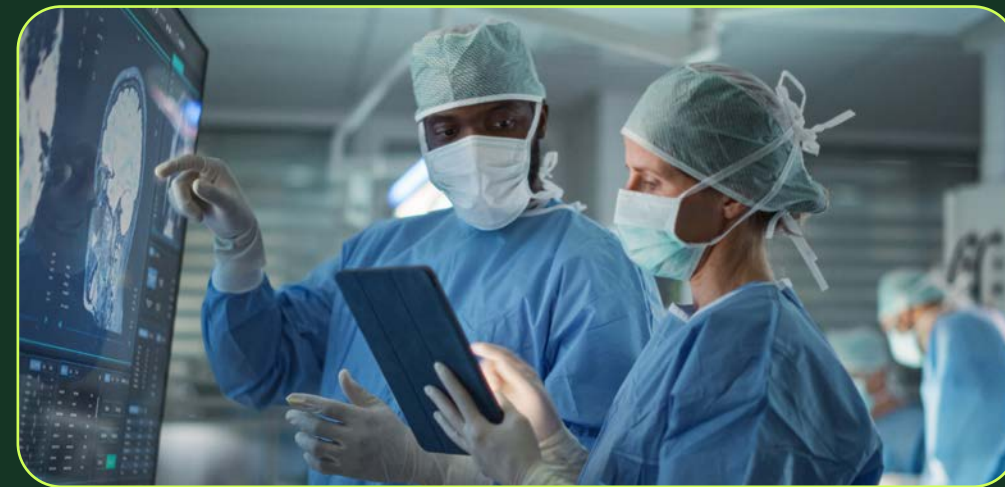
Digital Health & AI Conference