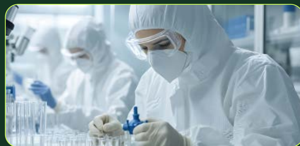
Laboratory Management (Day 2) Conference