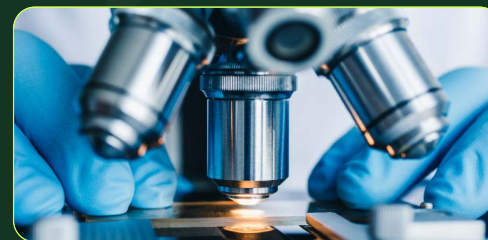
Laboratory Medicine Conference