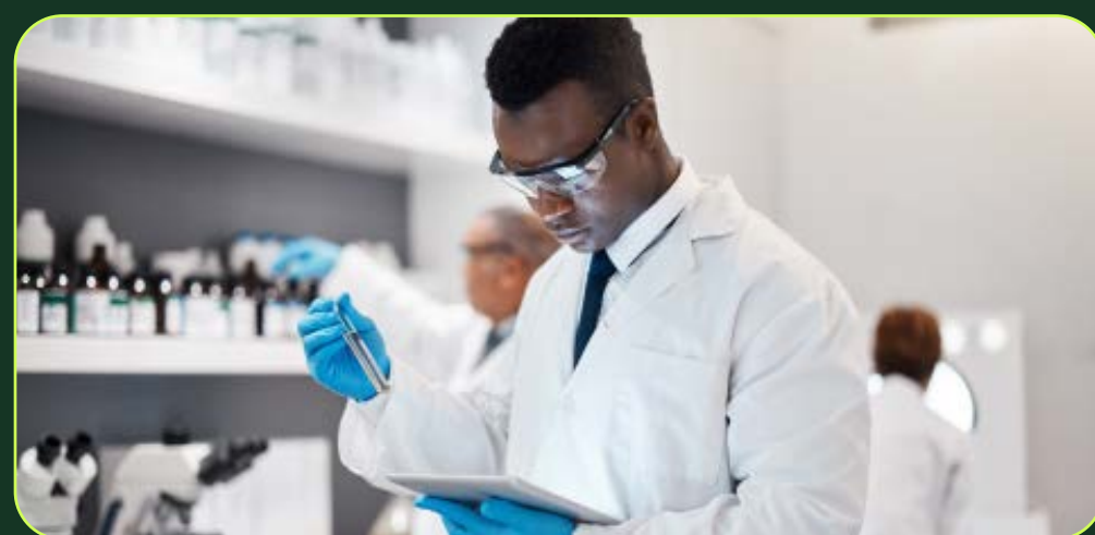
Laboratory Management (Day 1) Conference