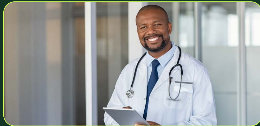
Healthcare Leadership Forum