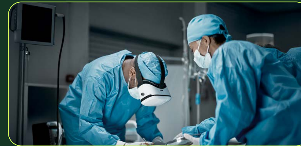
Antimicrobial Resistance (AMR) Conference